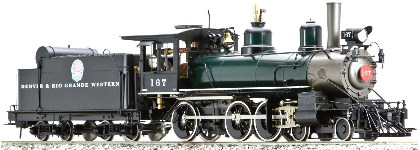
AL87-251 T12 #167 Green, Moffat Logo, Live Steam