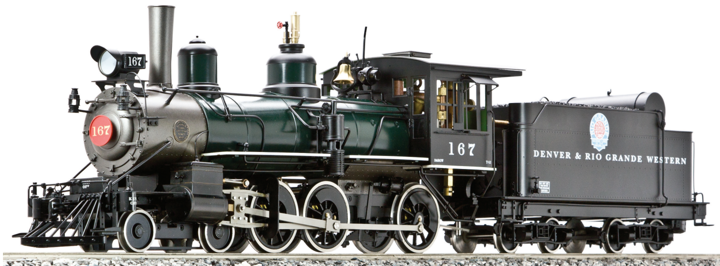
AL87-251 T12 #167 Green, Moffat Logo, Live Steam

Denver and Rio Grande Western Class T-12 was built in 1883 by Baldwin Locomotive Works for the Denver and Rio Grande Railroad. It was built as a passenger locomotive with 46" drivers, the second largest drivers used on any three foot gauge D&RGW locomotive.